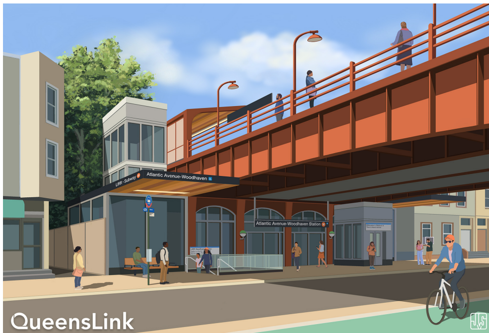
Conceptual rendering of QueensLink's proposed Atlantic Av-Woodhaven station, with nearby park space, protected bike lanes, and transfers to the LIRR Atlantic Branch