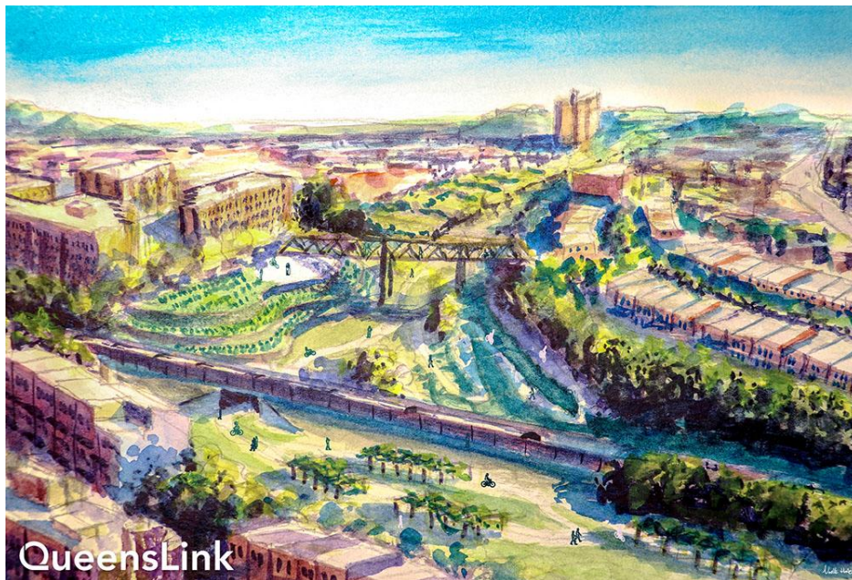
Aerial view of QueensLink’s proposed Rego Park Gardens, a new park on the LIRR’s former Whitepot Junction

These advocates demanded that Mayor Eric Adams and Governor Kathy Hochul greenlight an Environmental Impact Statement (EIS) to study the widespread benefits of QueensLink’s visionary rails & trails proposal. Such a high-profile event serves not only as a testament to QueensLink’s growing momentum, but also to the crucial need for expanded subways in transit deserts such as South Queens. A recent QueensLink EIS petition has amassed 1000+ signatures, and the organization continues to engage in regular community outreach events.